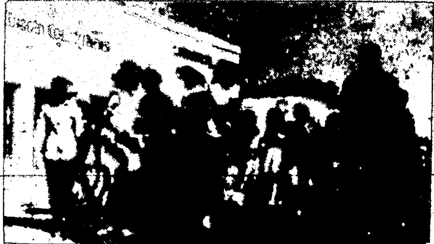
SENIORS LEAD — The parade is on as seniors lead the freshmen through their initiation.