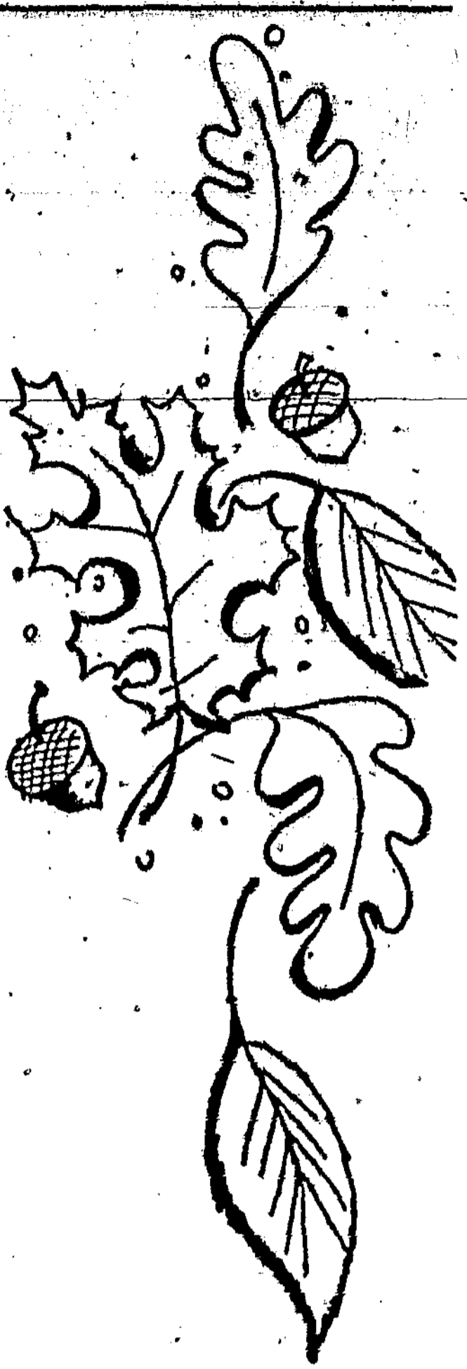
Pretty as leaves in autumn