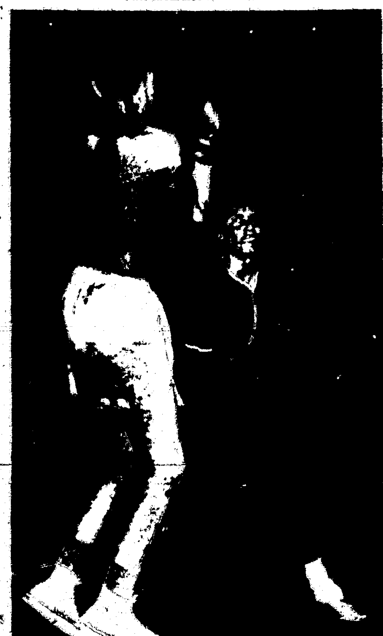
Bobby Barez, senior

Women of the Capitan Methodist Church will serve lunch during the day.