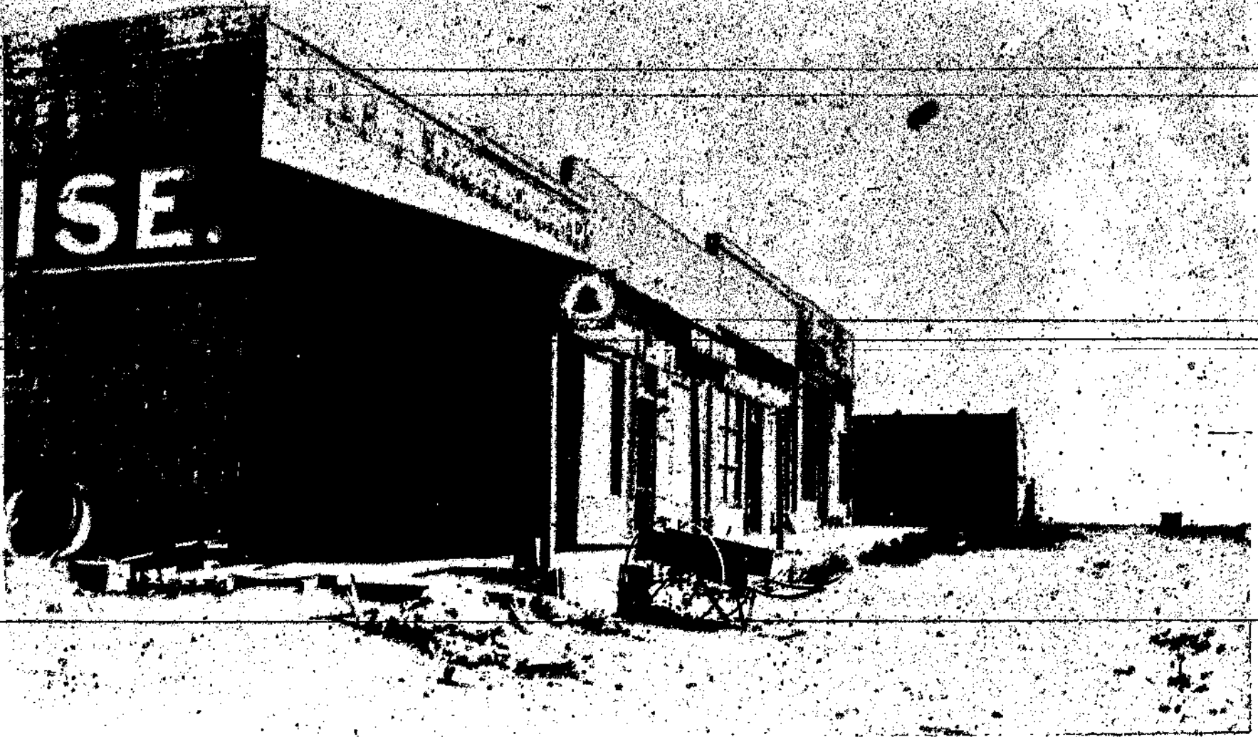
OSCURO, N.M. — 1920

The queen is expected to conduct the 1968 queen clinic at the State Fair in Albuquerque. The queen will receive a trophy belt buckle, a tiara, a bouquet of roses, money from the Lincoln County Fair Board and the Lincoln County Commissioners, along with the entry money from the other queen contestants.