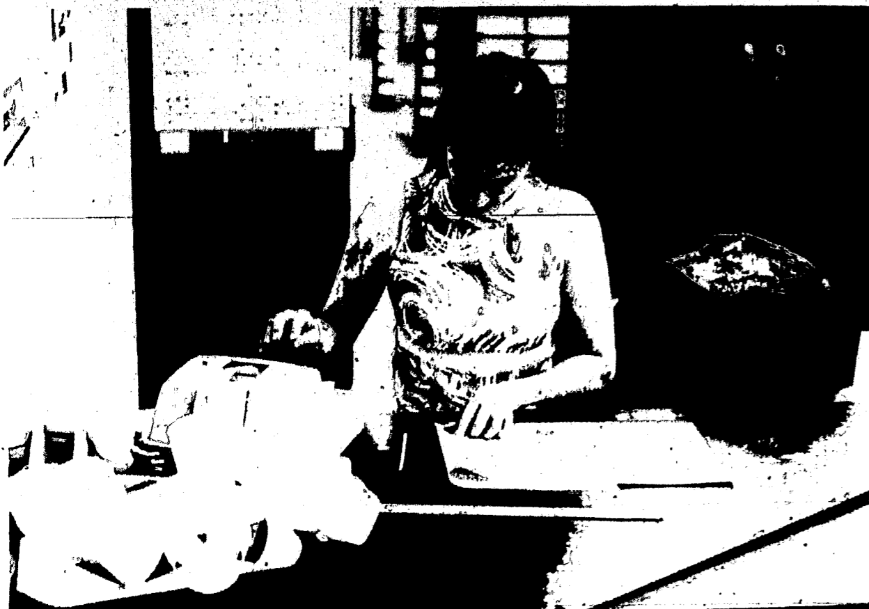
tabulating votes . . .