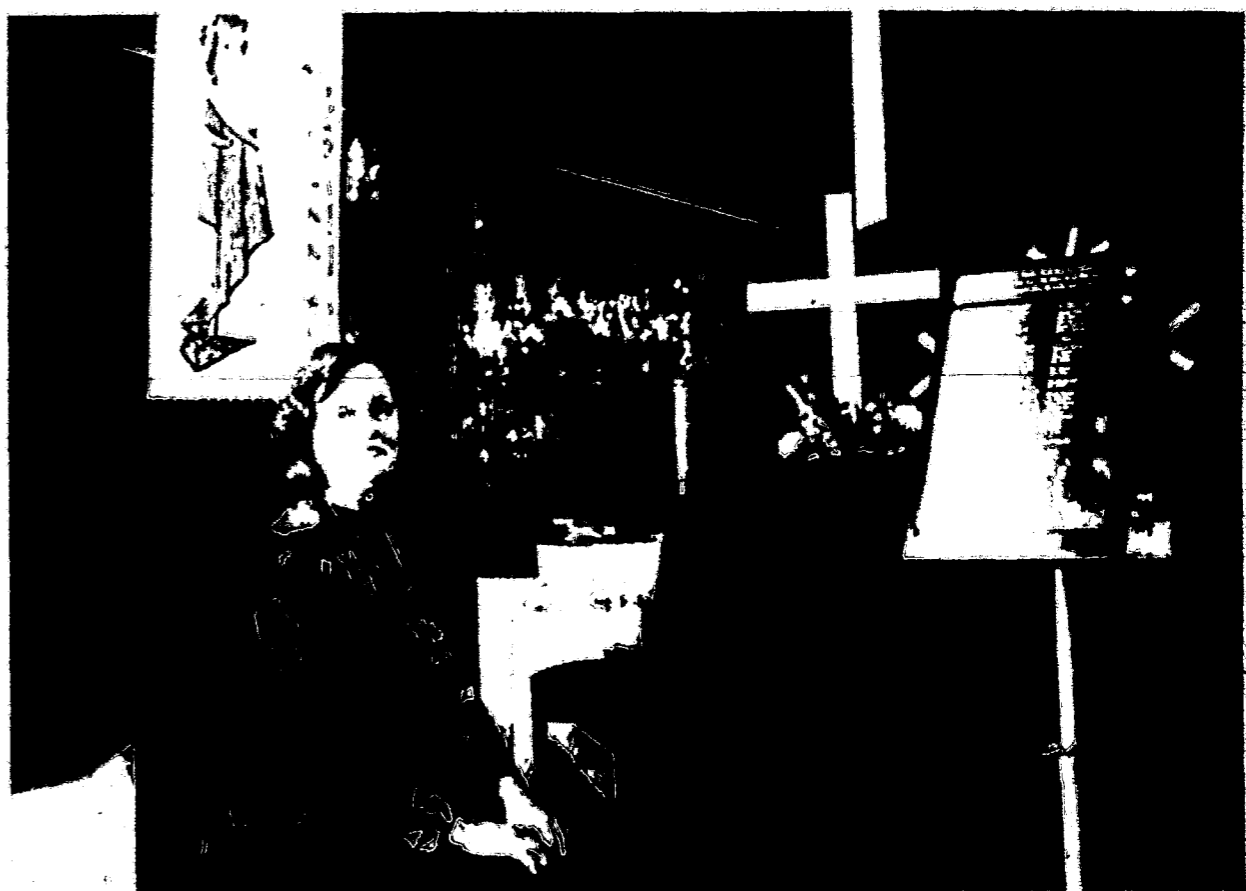
featured artist . . .

A total of 1418 Democrats voted, while 1191 Republicans voted.