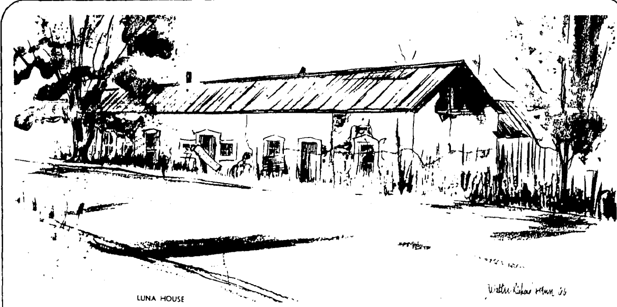
Luna House Luna House Museum and Visitor's Center

Work days for the Nogal Mesa Ranchmens Camp Meeting have been set for June 27 and July 11. On those dates, anyone wishing to volunteer a helping hand in preparing the grounds for this year's encampment to be held July 15 through 19, bring a basket lunch and spend the day. The work will entail general repairs and the installation of more lighting facilities.