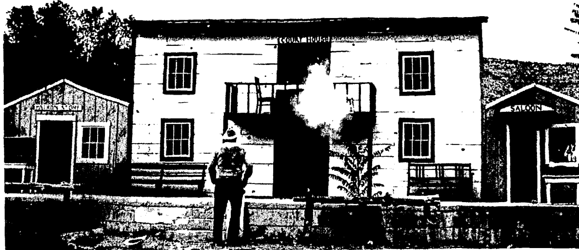
SHOOT-OUT scene at Pageant Show.

More charges might be filed on other inmates as the investigation continues.