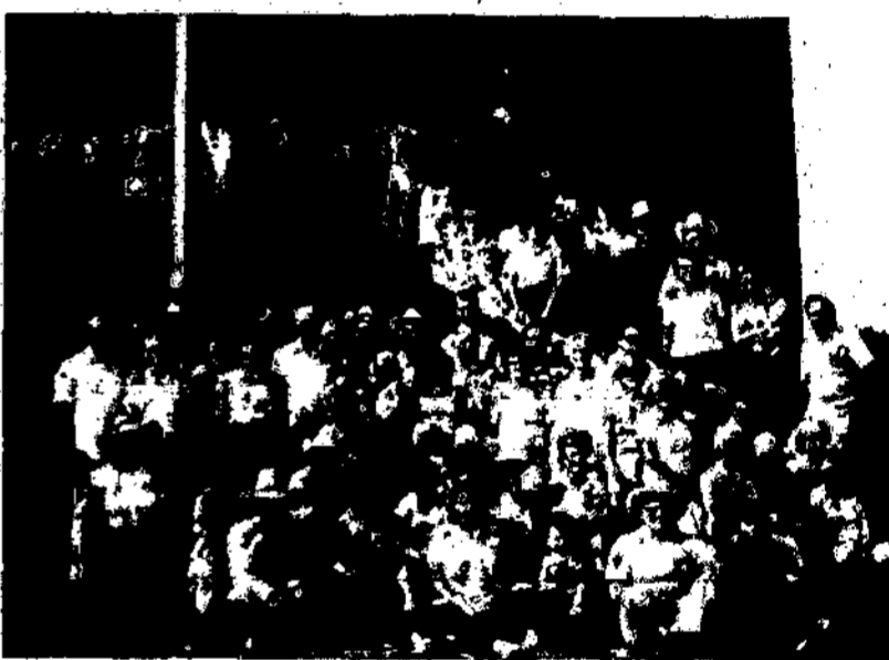
WARD clan, 115 strong, gathered Reunion July 25-26.