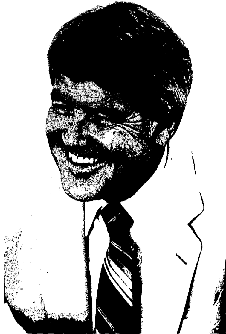
U.S. CONGRESSMAN JOE SKEEN To Emcee Event

Systems will also provide electricity for communications equipment, appliances and water pumps at Signal Peak Lookout in the Gila National Forest and at Horsethief and Hyde Mountain lookouts in the Prescott National Forest.