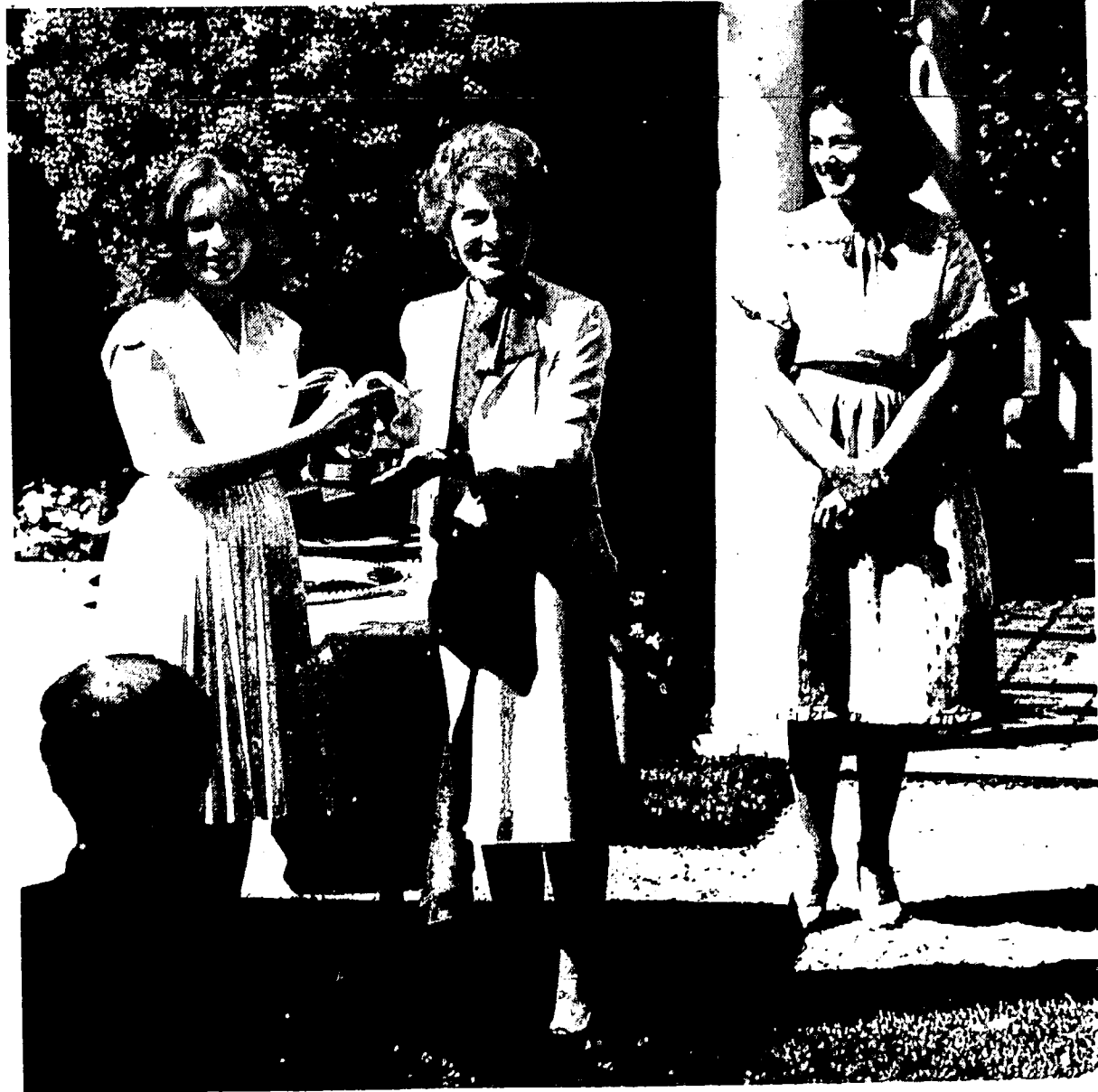
MRS. RONALD Reagan presents Steuben crystal eagle to General Federation of