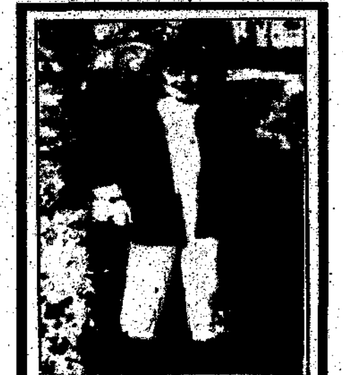
Isn't It Nifty, Look Who's D'How 50

The South Central Mountain Resource Conservation and Development Council will meet in Alamogordo Tuesday, Nov. 24 in the Alamogordo City Commission Chambers, 511 E. Tenth St. (located on the west end of City Hall). Coffee will be served at 9:30 a.m. followed by the general business session at 10 a.m. Reports on various project measures will be given and new proposals accepted.