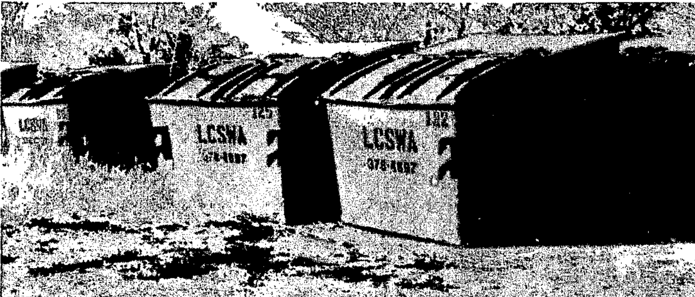
COUNTY RESIDENTS WILL SOON be using these dumpsters to dispose of trash. The dumpsters will belong to and be collected by the Lincoln County Solid Waste Authority, whose office phone number is printed on the side. County residents will be charged $5.25 a month for the trash service, and bills will be mailed on a quarterly basis. Dumpsters are to be placed in various county locations this week and next.