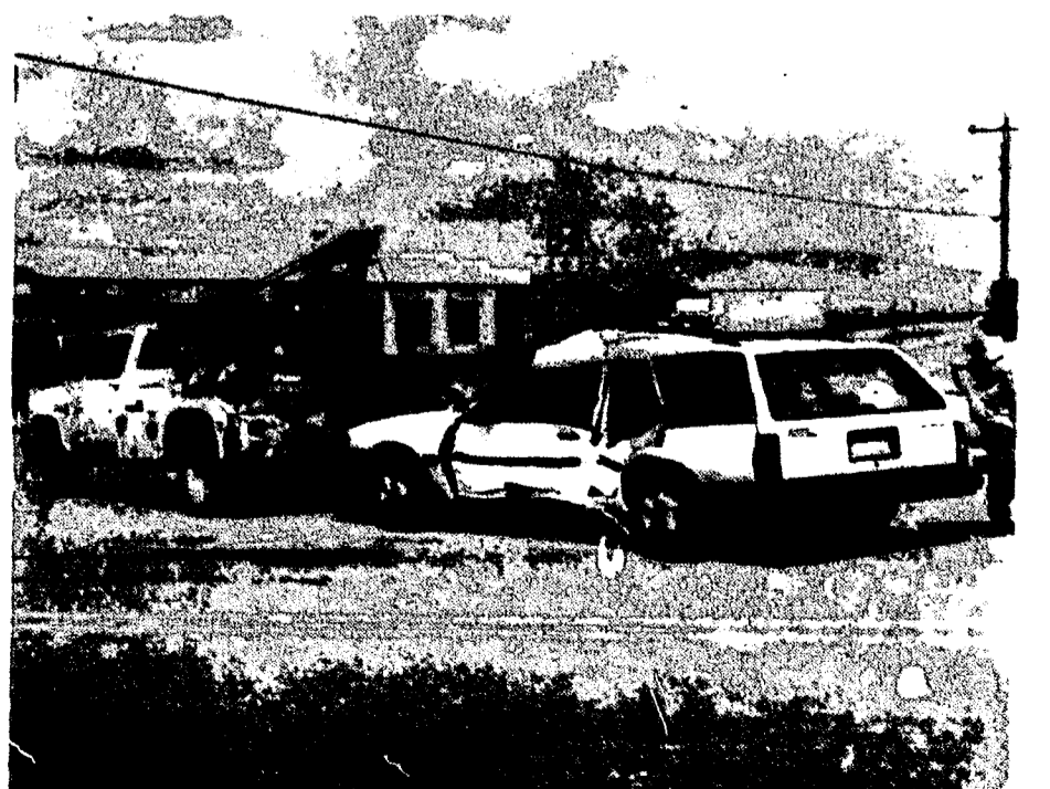
THERE WAS ANOTHER ACCIDENT MONDAY at the intersection of Highways 54 and 380. This small car going north on 54 pulled out in front of a semi travelling east on 380. Many requests have been made to the state highway department for a traffic light at the dangerous intersection.