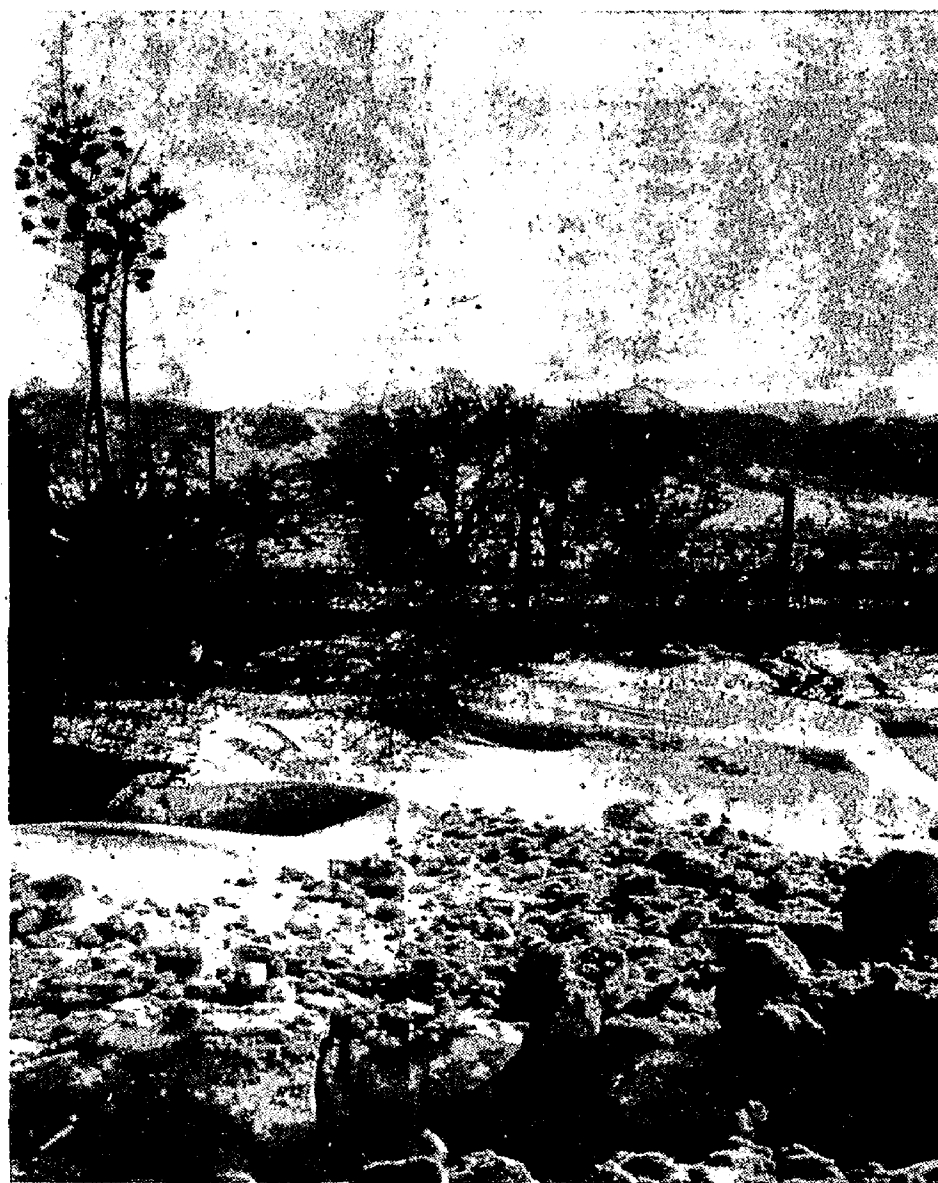
CARRIZOZO SNOW. Drifts along the ball park at Carrizozo Recreation Area give the impression that lots of snow fell on the county seat. But high winds Monday kept the snow in the air, causing almost zero visibility along Highway 380, and creating fantastically shaped drifts. Nogal Peak and the White Mountains in the background got 14 to 24 inches during the four-day storm.