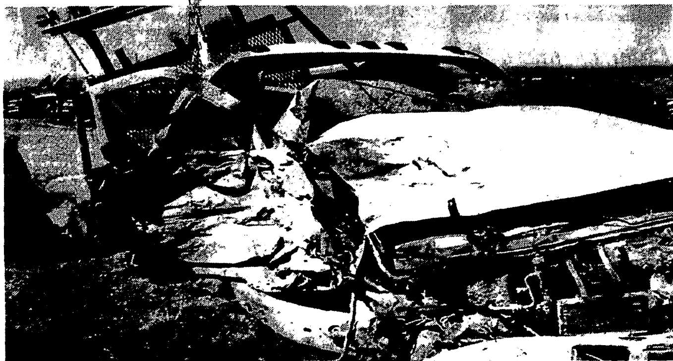
TWISTED METAL IS ALL THAT REMAINS of a 1966 Ford pickup after a head-on wreck with a 1995 GMC pickup February 25. Two people were killed in the accident at the bottom of Red Hill about 12 miles west of Carrizozo on Highway 380. The body of the Ford pickup was torn loose from the engine and transmission. Workers loaded the pieces of the Ford pickup on a trailer to move it to Carrizozo.

No alcohol was involved in the accident, which police are still investigating.