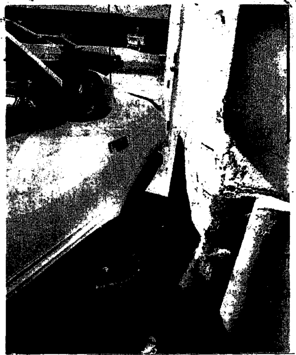
FRONT END DAMAGE to the pickup and building was the result of an accident Sunday at noon when this pickup crashed into the Carrizozo Taxaco building. The right front tire and wheel was knocked off and the pickup landed on top of it. The brake line was intact when the wrecker moved the vehicle. There were no injuries. Carrizozo Police investigated the accident.

Two questions on the Ruidoso ballot had mixed results. Although the two questions were interconnected, the first, asking for voters to extend a one percent municipal supplemental gross receipt tax beyond the year 2003 failed with 688 against and 661 for. The second, which passed 880 to 476, asked voters if bonds could be issued on the gross receipt tax. According to Jackson the current one percent supplemental tax was enacted in 1982 to be used for bonding. Until the bonds are paid off in year 2003, the one percent tax continues to be collected. The first question would have extended the one percent beyond 2003 to allow for additional bonding. "The failure of the first question does not repeal the existing one percent gross receipt tax," Jackson said.