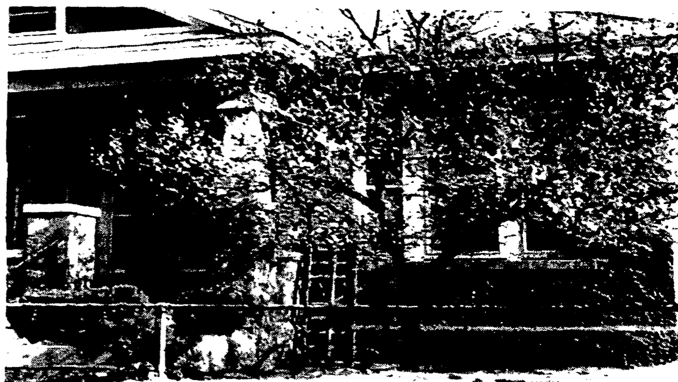
SIGNS OF SPRING. Blossoms filled the air with their fragrance in Carrizozo this week as warm temperatures caused apricot and peach trees to bloom. Daffodils, hyacinths and crocus flowers were also in bloom throughout Carrizozo, the Lincoln County seat. Cooler temperatures are predicted for this weekend.