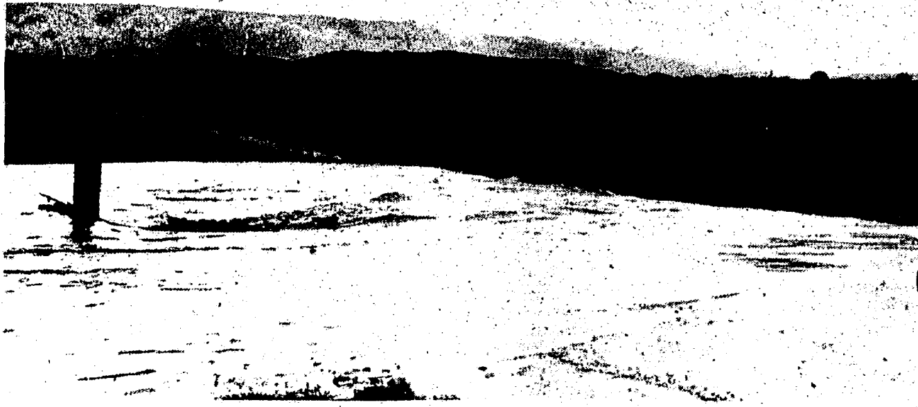
WATER, WATER EVERYWHERE. From drought to flood. Heavy monsoon-like rains drenched Lincoln County early this week, causing flooding in the Rio Salado at the Capitan Gap Road crossing east of Capitan.