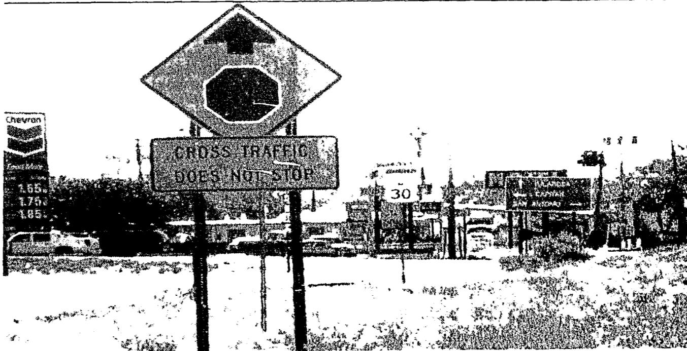
ANOTHER NEW SIGN. A new larger stop sign to warn motorists coming into Carrizozo from the north on Hwy. 54 was installed last week in an effort to curb accidents at the Hwys. 380-54 intersection. The town and county commissioners have sent requests to the state highway department to consider a four-way-stop at the intersection, or any other options what will make the intersection safer.