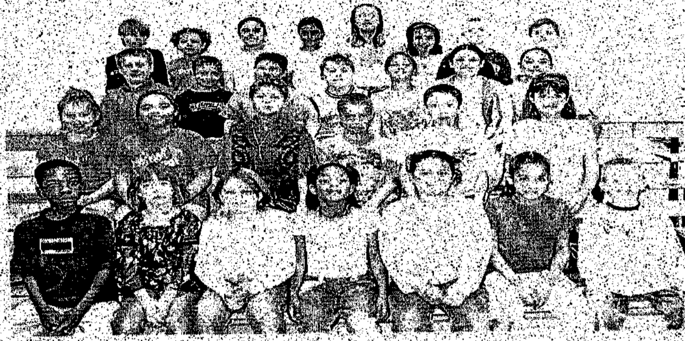
Carrizozo 3rd, 4th and 5th grade "BRAVO" for September