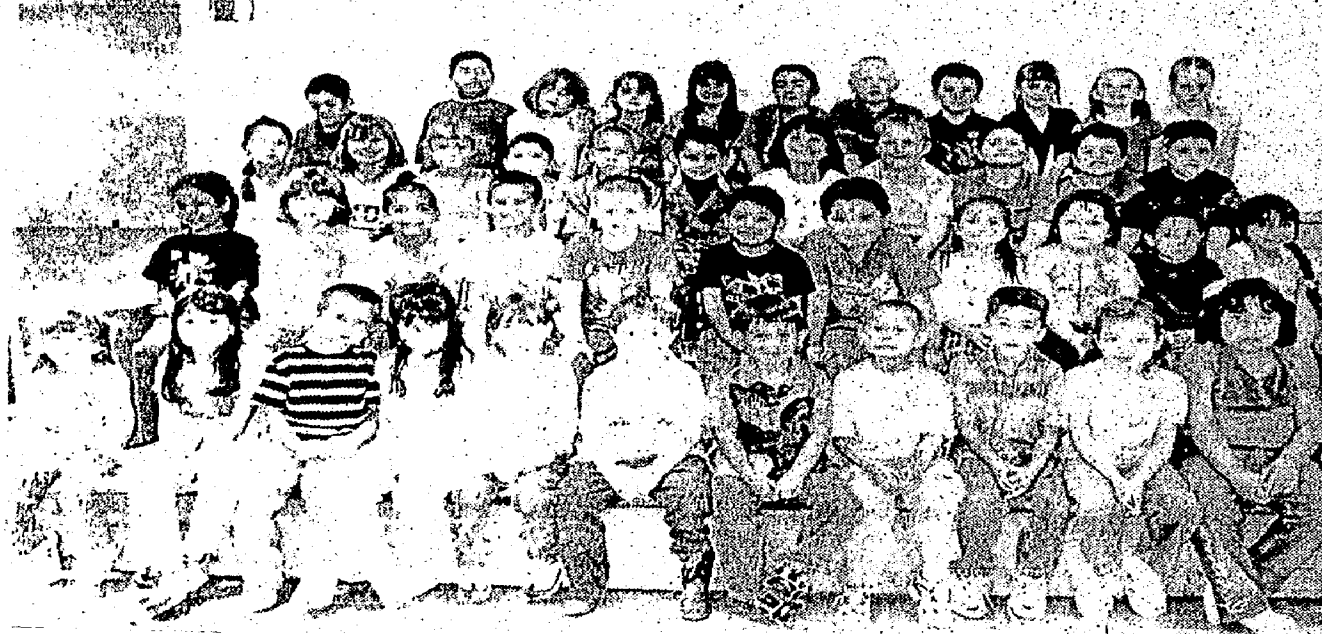
Carrizozo Kindergarten, 1st and 2nd grade "BRAVO" for September