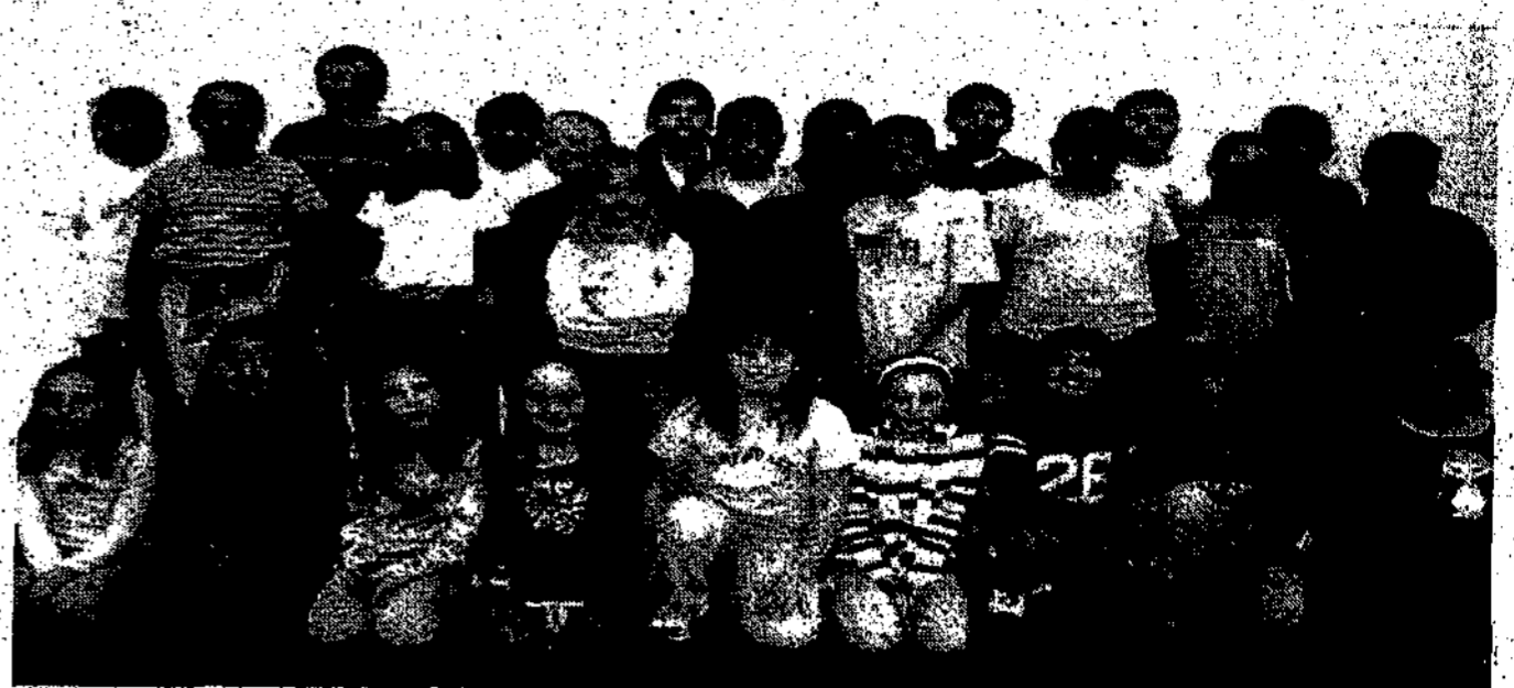
Carrizozo Grade School "BRAVO!" Achievers for November 2004 / 3rd, 4th and 5th Grades