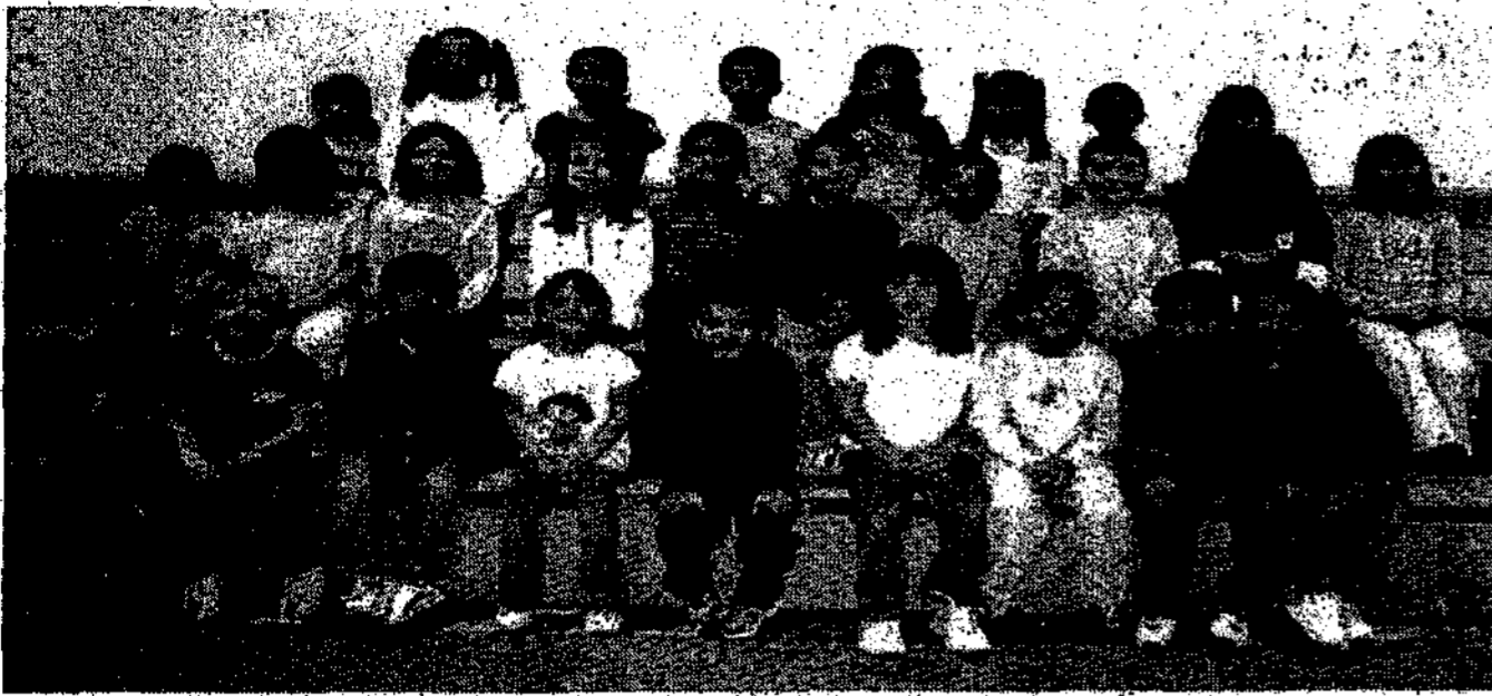
Carrizozo Grade School "BRAVO!" Achievers for November 2004 / Kindergarten, 1st and 2nd Grades