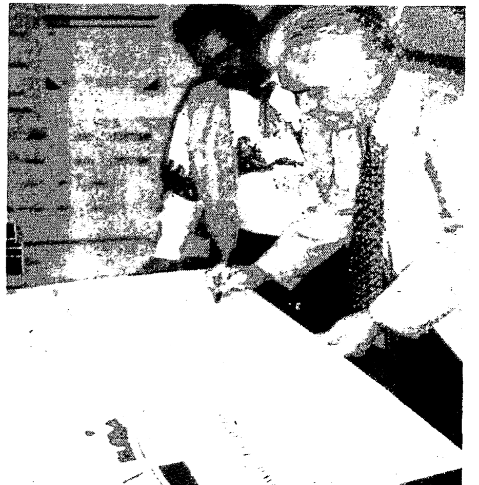
IT TOOK A BIG CHECK for USDA Rural Development State Director Jeff Condrey to fill in the $1,839,250 amount in USDA grants and loans for the Town of Carrizozo new wastewater treatment facility. Condrey presented the check to the mayor of Carrizozo during a ceremony on Monday, December 27 at Carrizozo (temporary) Town Hall offices. The new facility will consist of four lagoons, a new operational building, new disinfection and pumping system and when done will be in compliance with all state and federal regulations.