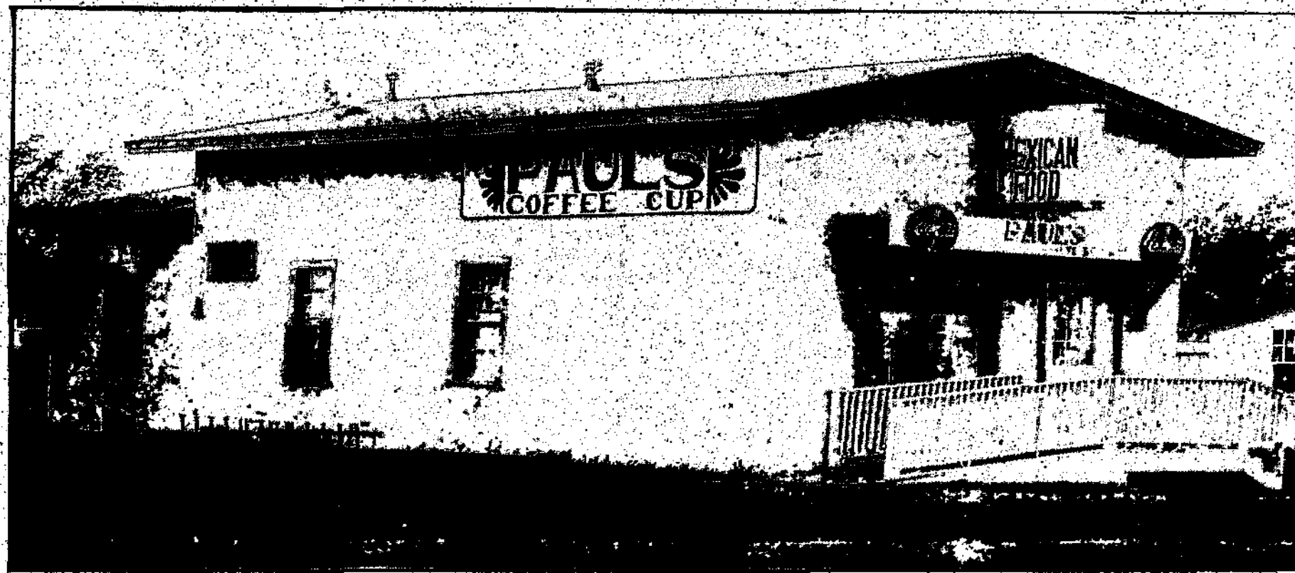
PAUL'S COFFEE CUP, a Carrizozo landmark and source of traditional local comfort food for over 50 years, closed its doors in October.