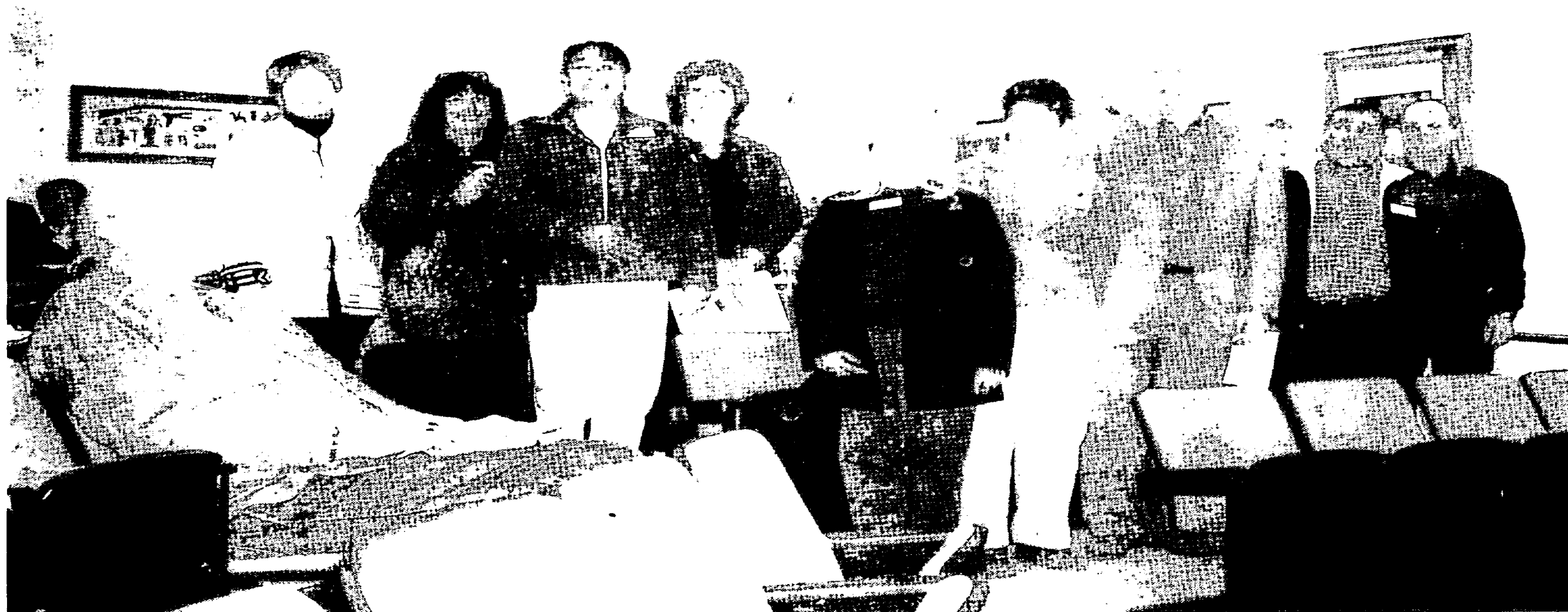
MEMBERS of the Leadership Lincoln class of 2006 dropped in to attend a portion of the December meeting of the Lincoln County Board of Commissioners.