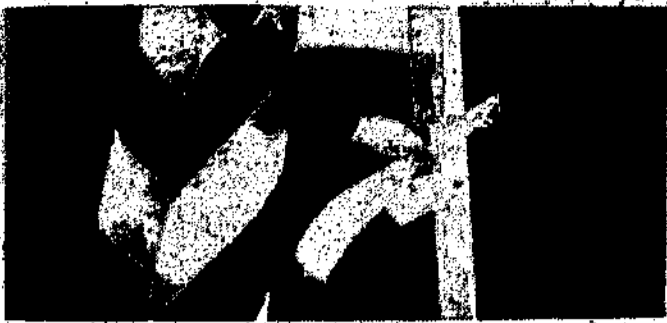
UNTIL THEY COME HOME.