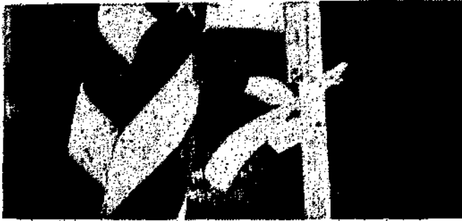
UNTIL THEY COME HOME