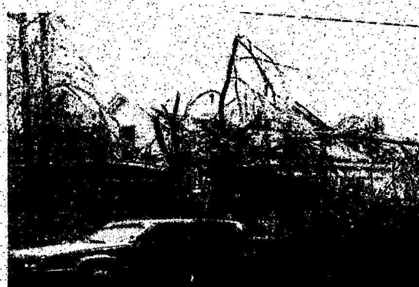
WE THINK IT'S COLD HERE!! Tree limbs broken by the weight of ice surround a vehicle in this ice storm that hit Monett, MO and other portions of the midwest the past few days. Many areas in Missouri were without electric power.

For additional information, concerns or questions, please contact the Smokey Bear Ranger District Office at (505) 257-4095, between 7:30 a.m. and 4:30 p.m., Monday through Friday.