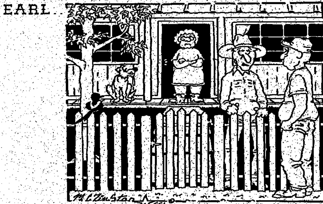
"MY MOTHER-IN-LAW IS TERRIBLY FRUSTRATED WITH ME... SHE HAS ALL THE ANSWERS TO EVERYTHING, BUT I WON'T ASK HER THE QUESTIONS." Big Dry Syndicate

Escape from the winter storm is possible only if you stay inside and keep warm. Aren't winter storms fun?