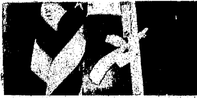
UNTIL THEY COME HOME.