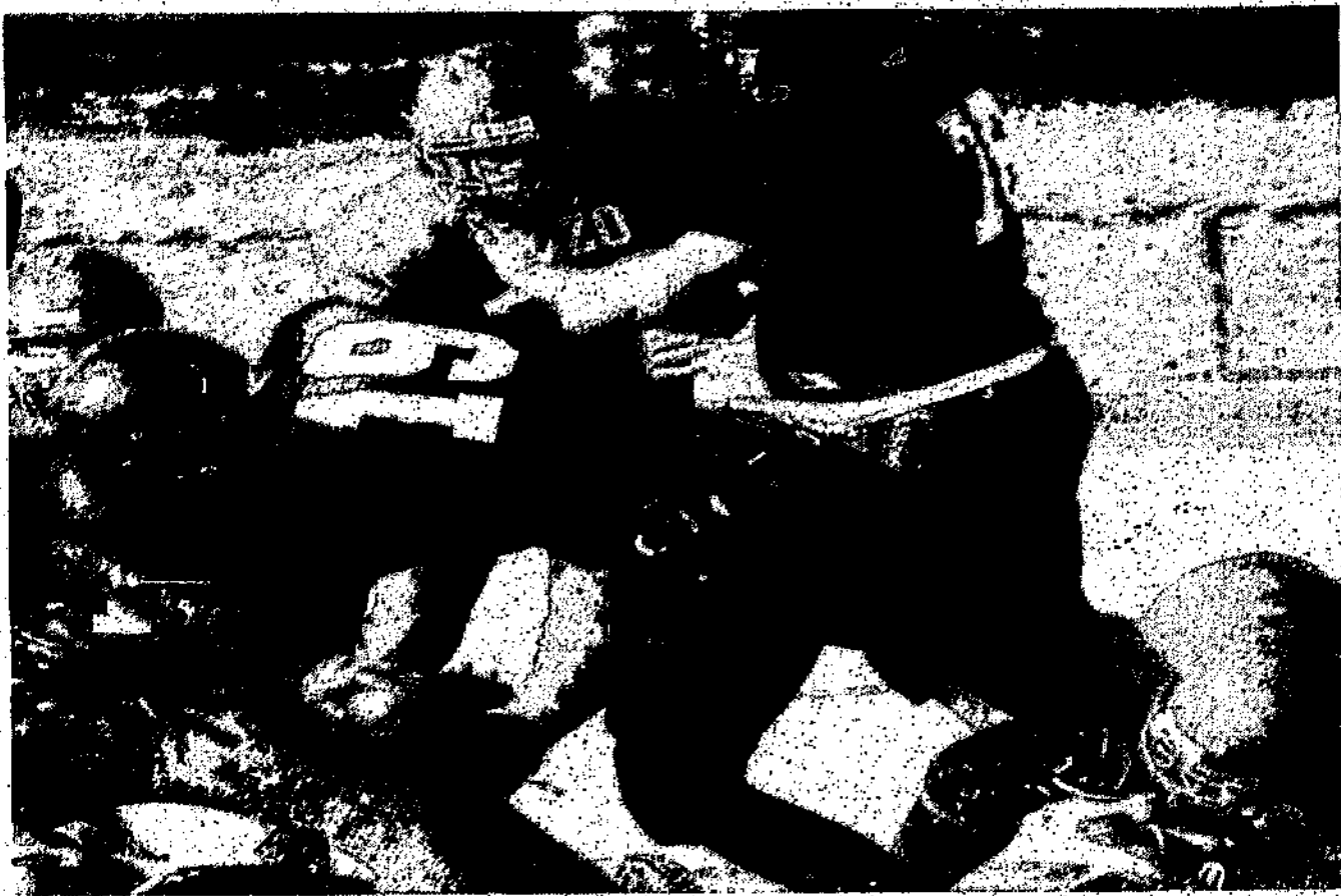
I'VE GOT HIM, I'VE GOT HIM! -- Carrizozo defender has a good grip (lower right) on leg of Fox QB Berry Stinnett (#19) and waits for help from teammates in Saturday action of state final in Fort Sumner. Final score Foxes 39, Grizzlies 14.