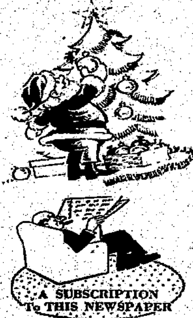
A SUBSCRIPTION TO THIS NEWSPAPER