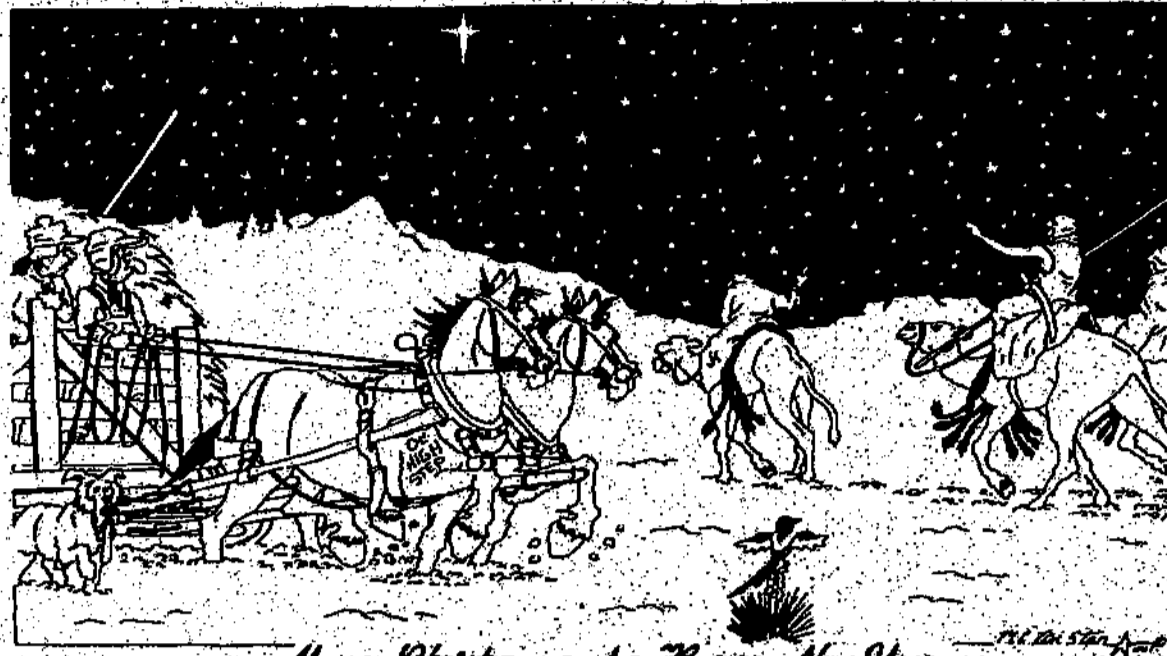
Merry Christmas and a Happy New Year Big Dry Syndicate