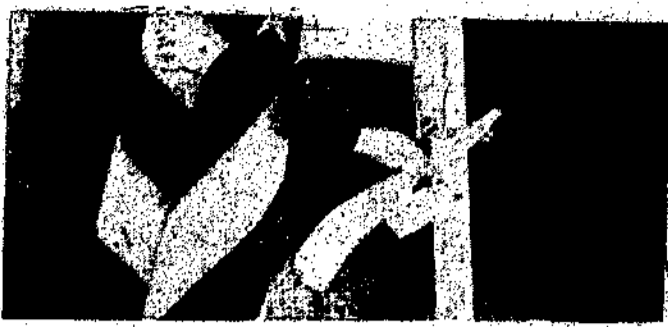
UNTIL THEY COME HOME.