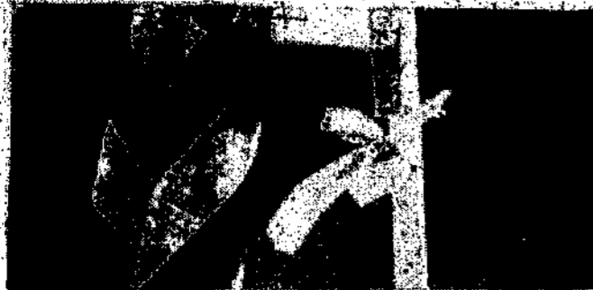
UNTIL THEY COME HOME