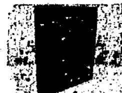
Last one - Signed copy of Jack Williamson book