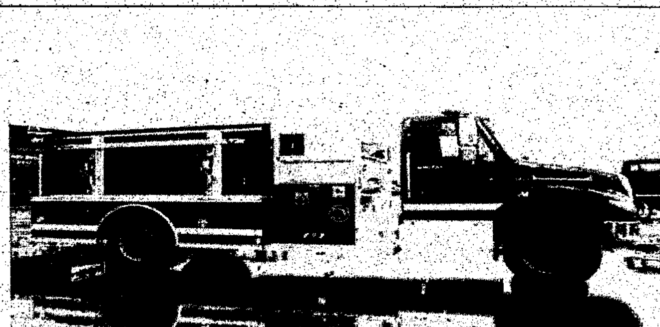
SEVERAL Lincoln County fire departments are awaiting the delivery of new apparatus. This fire truck is expected to be added to the Nogal FD equipment roster within the next month or so