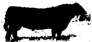
Pick of 1 Registered Yearling Bull from G 13 Angus Ranch