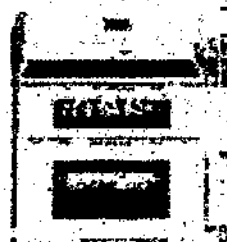
Maytag Gemini Free Standing Range, McDaniel's, Clovis

Public Television from Eastern New Mexico University, Portales, New Mexico This ad is co-sponsored by Lincoln County News, Carrizozo, New Mexico