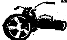
#30 Big Flyer from Radio Flyer