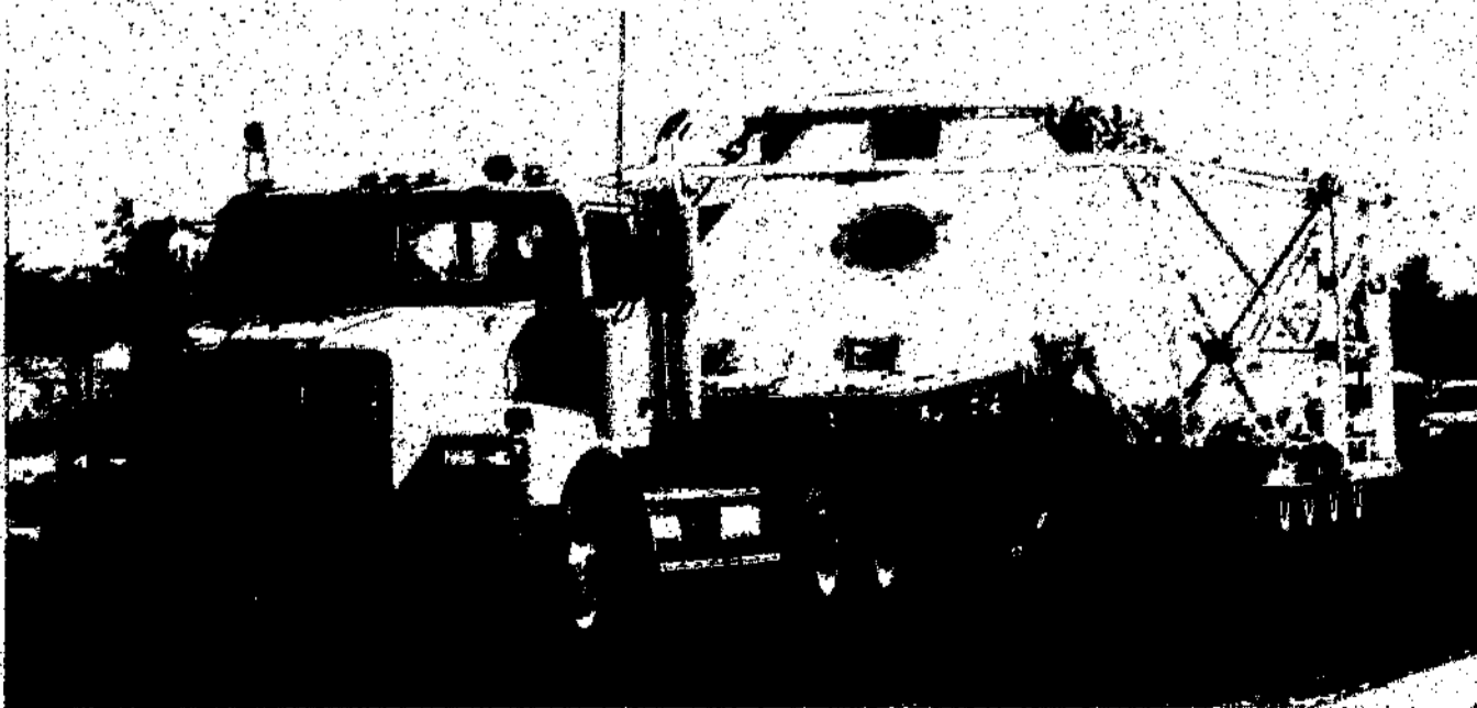
NASA'S Pad Abort One Crew Module, the next generation of a manned-spacecraft, stopped at Holloman Air Force Base in Alamogordo last week, then went on to White Sands Missile Range. The module was escorted from the BEAR Base portion of Holloman by members of the 49th Security Forces Squadron before officers from the NM State Police and the NM Department of Public Safety Motor Transportation Division along with deputies from the Otero County Sheriff's Department took over at U.S. 70. Billed as the shuttle replacement program for NASA, the Orion Program is designed to take the next generation of astronauts to space.

Following the lecture, refreshments will be served in the greenhouse. If there are questions, call the library at 354-3035.