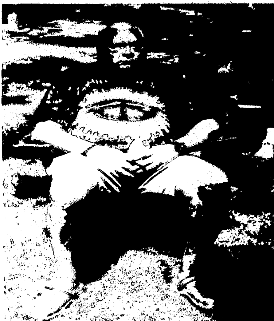
WE DON'T KNOW if great weather and good music inspired this gentleman's colorful attire, or if he was reminiscing about the 40th anniversary of the 1969 Woodstock concert, but he was one of many who came out to enjoy a free concert in Carrizozo recently.