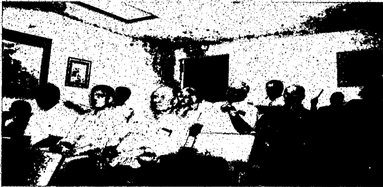
LOCAL LANDOWNERS and agents of wind energy development companies attended last week's meeting of the Lincoln County Board of Commissioners to discuss a county ordinance to regulate wind farm sites.