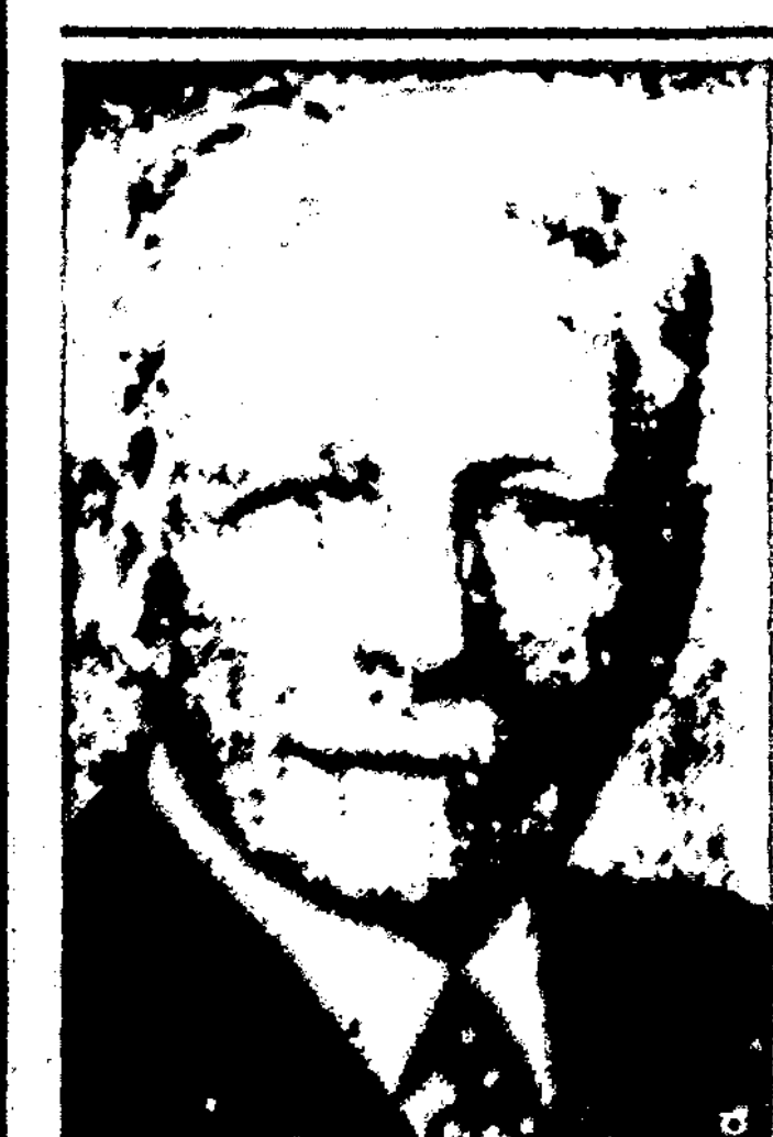
PATRICK J. HURLEY FOR U. S. SENATOR