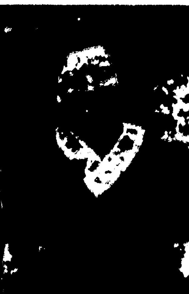
DEMOCRATIC CANDIDATE FOR COUNTY CLERK