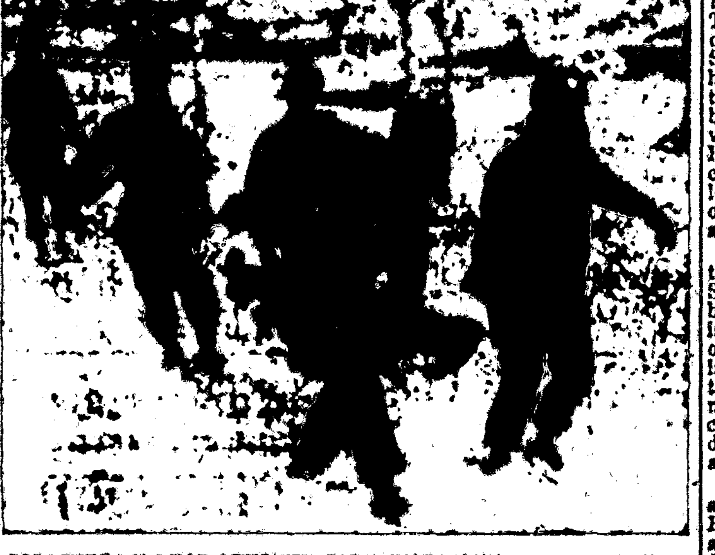
SOLDIERS RUN FOR SHELTER CARRYING WOUNDED . . . A United States Sergeant, two soldiers and a Republic of Korea soldier ran for the nearest shelter bearing a wounded United Nations officer on a litter. They are under the direct fire of an enemy burp gun, as the grimaces of their faces testify.