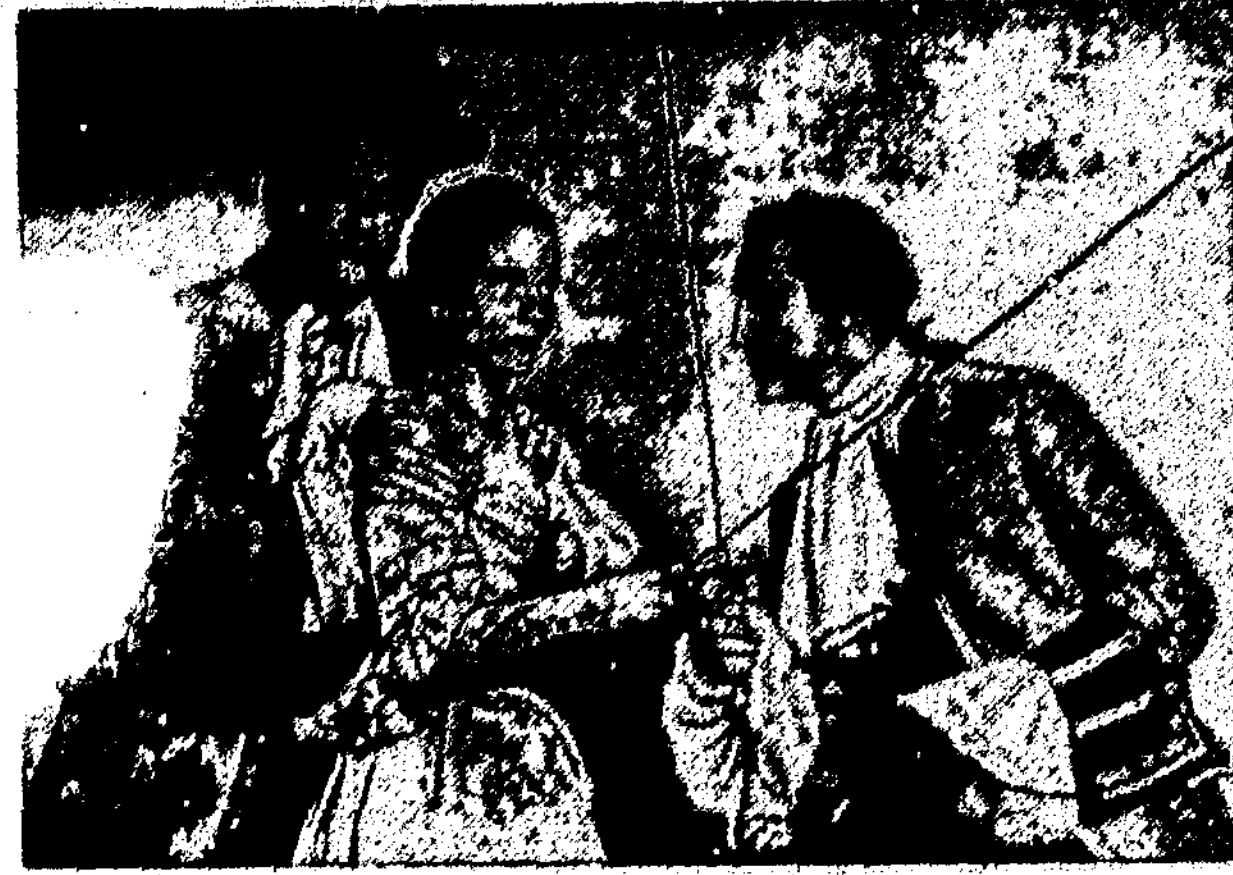
NEW COMEDY—Bob Hope and Joan Fontaine star in the new technicolor comedy, "Casanova's