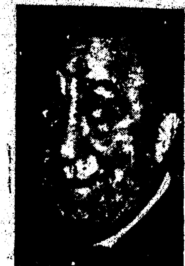
SHOWS FOUR DAYS—For a month the Warner Bros. "Mar-Jerie Merringer" company transplanted itself from the second stage of Hollywood to the famous Ruidoso resort of Searock Mesa to film the Herman Wouk best-selling novel which co-stars Gene Kelly and Natalie Wood with Ed Wynn (above), now in his 56th year of show business. The beautiful scenic resort will choose because of its location in beautiful location with the National South Wind, the scene of Mar-Jerie's early romantic adventures as described in the novel. The picture shows four days, Sunday through Wednesday, at Mt. Vase Shu-Dyn Drive-In Theatre here.