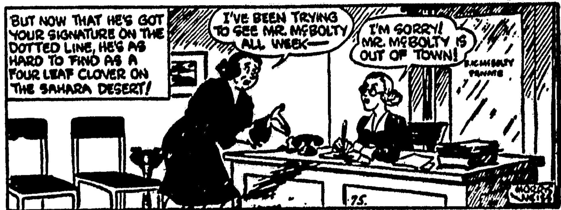
Rubber Stamps, Ruidoso News.