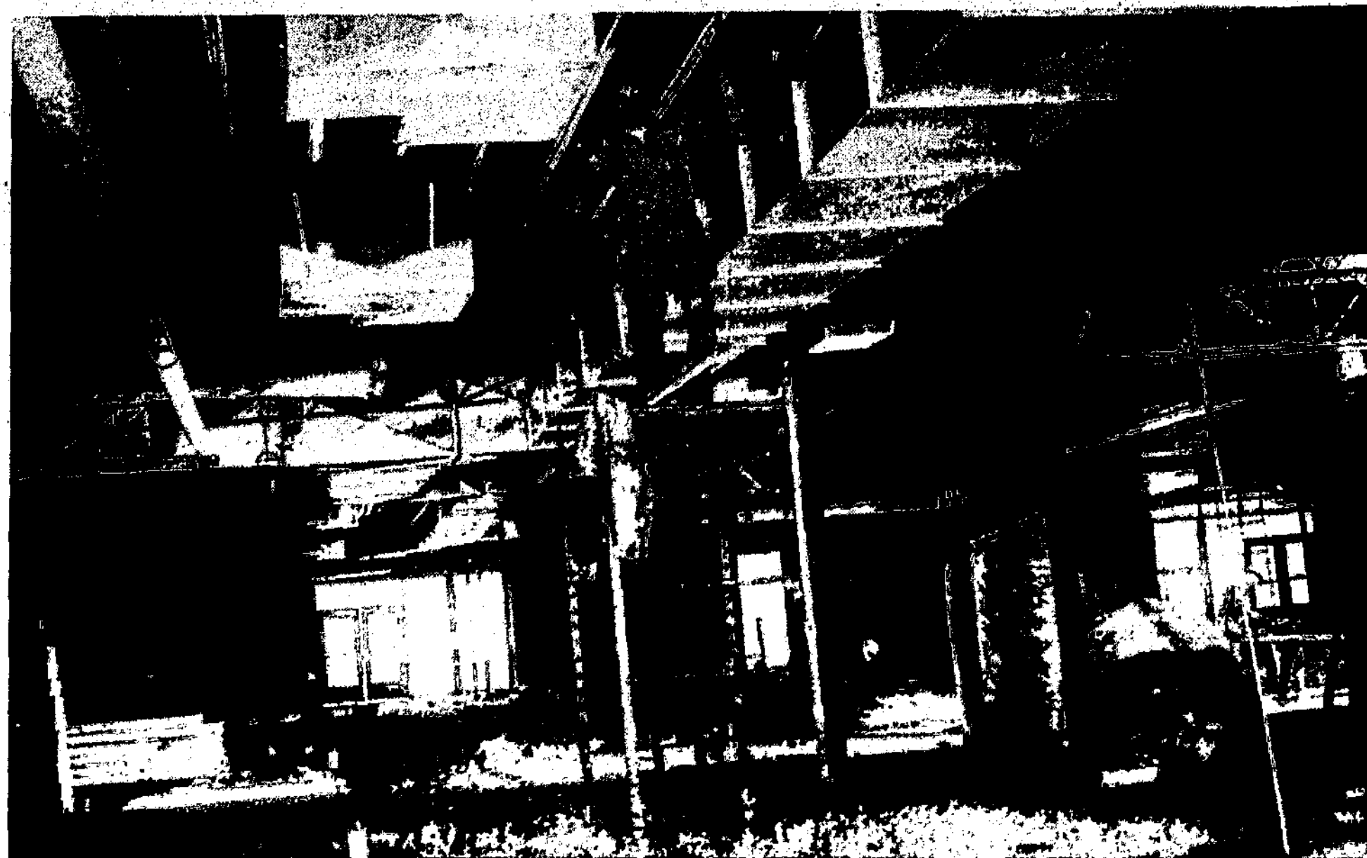
EDUCATION BUILDING center and a lounge-workroom. mid-February if all goes as planned. Construction will be complete in 16 classrooms, office space, media