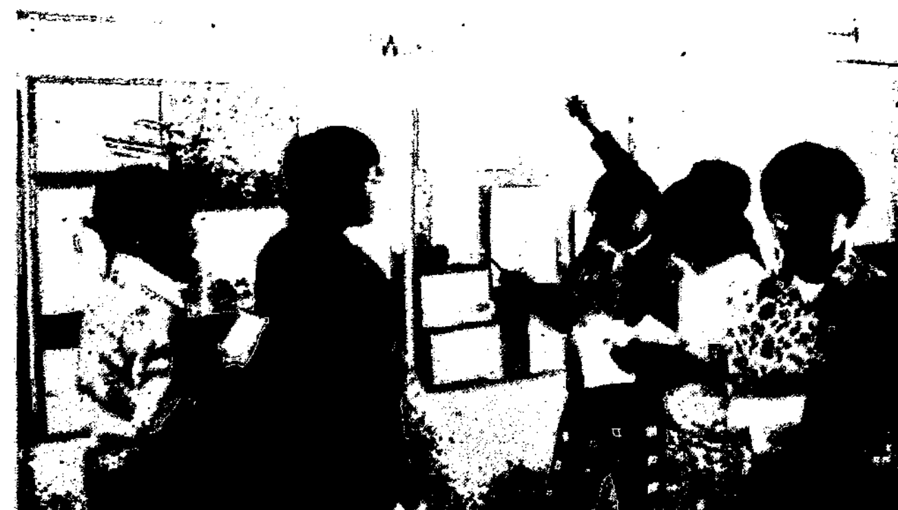
STUDENTS VOTING to name the cartoon contest winners.