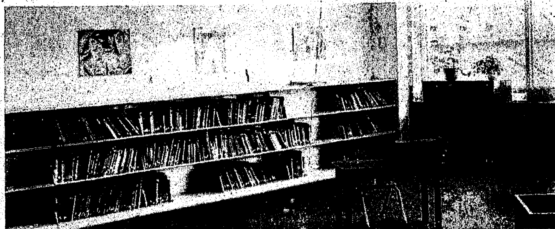
MEDIA CENTER in the 3,813 sq. ft. addition to the existing White Mountain school building opened for business this week.