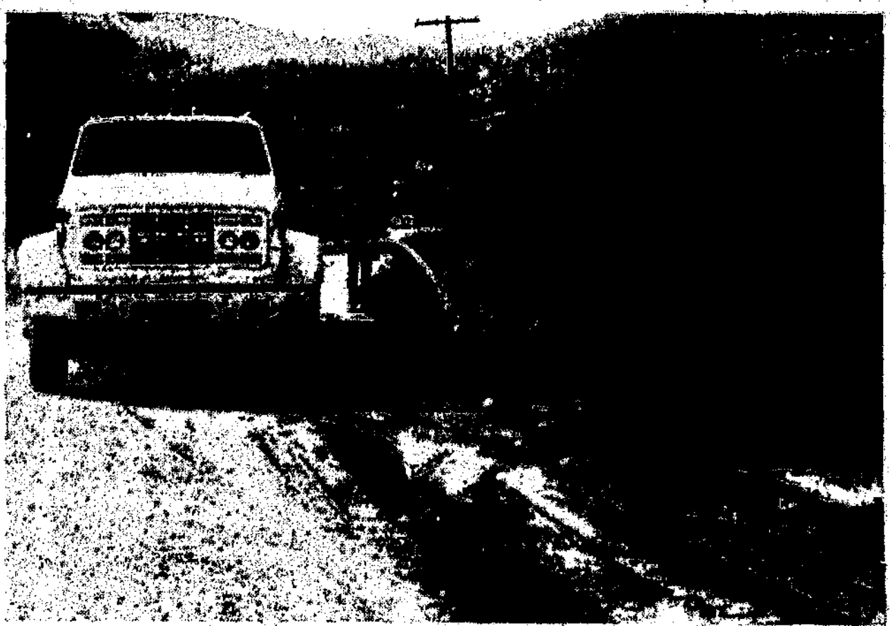
PIPE LAYING CREW at work in Gavilan Canyon Friday.

To further ease water pressure, and volume, problems during periods of excessive use, additional lines are scheduled for the Ponderosa Heights area in 1977.