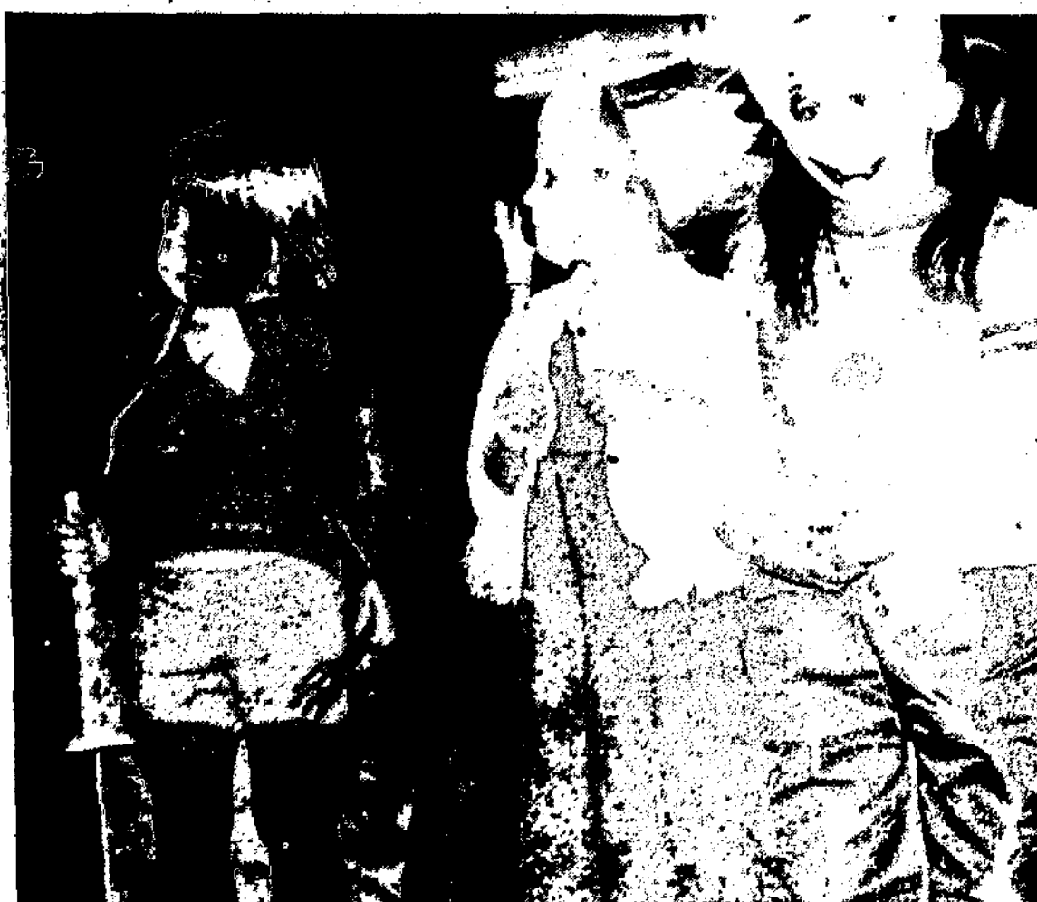
PRESCHOOL AGE goblins await costume judging results.