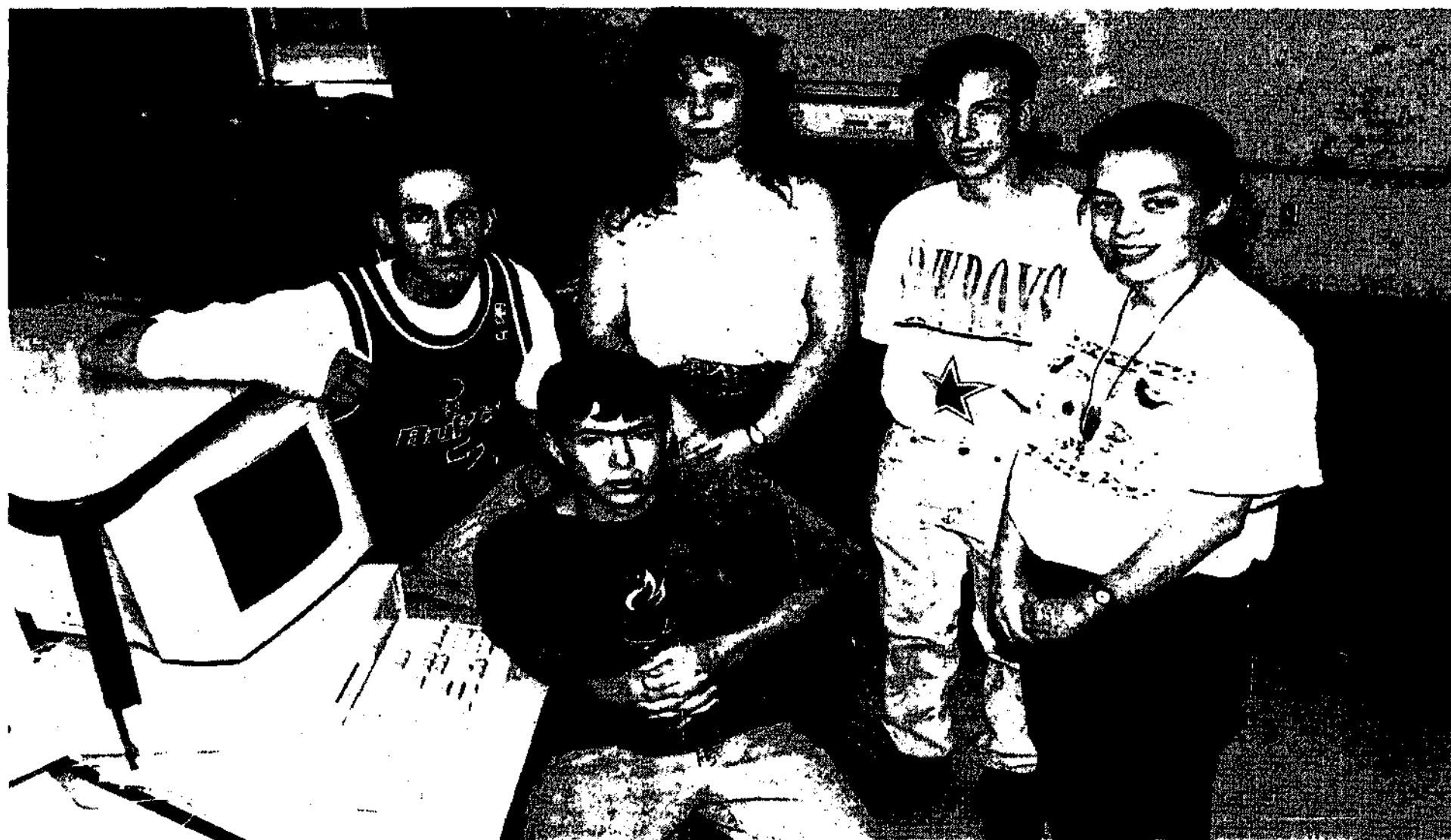
Supercomputing Challenge participants from the Capitan school district who competed in the 1995 contest with 181 school are (left to